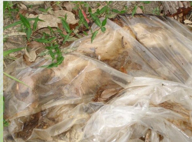
Dead animals Thrown on the side of the streets