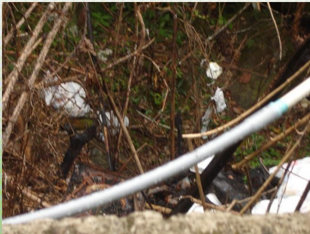
Water Pollution (river)