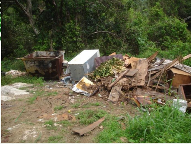
Solid Trash everywhere